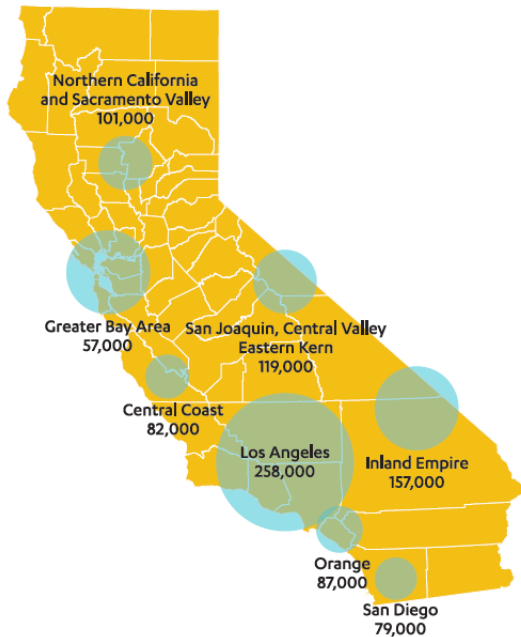
Figure 2: One Million Uninsured Californians Are Eligible for Financial Help

Covered California enters open enrollment with 1.7 million consumers. However, new data shows that there are more than 1 million uninsured Californians who are eligible for financial help to bring the cost of coverage within reach, including 57,000 people in the Greater Bay Area.